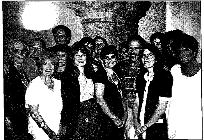
La Maison des Volcans, Aurillac (Auvergne) July 1992